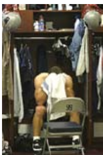
New England Patriots Locker Room