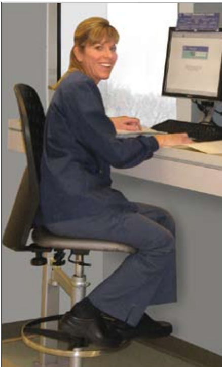
Shown with Apollo Chair

Where form meets function. A contemporary and comfort-conscious design paired with smart engineering make the Self-Returning Swivel Seat the perfect solution for any high-traffic working environment. Have piece-of-mind knowing your furniture will never be in the way.